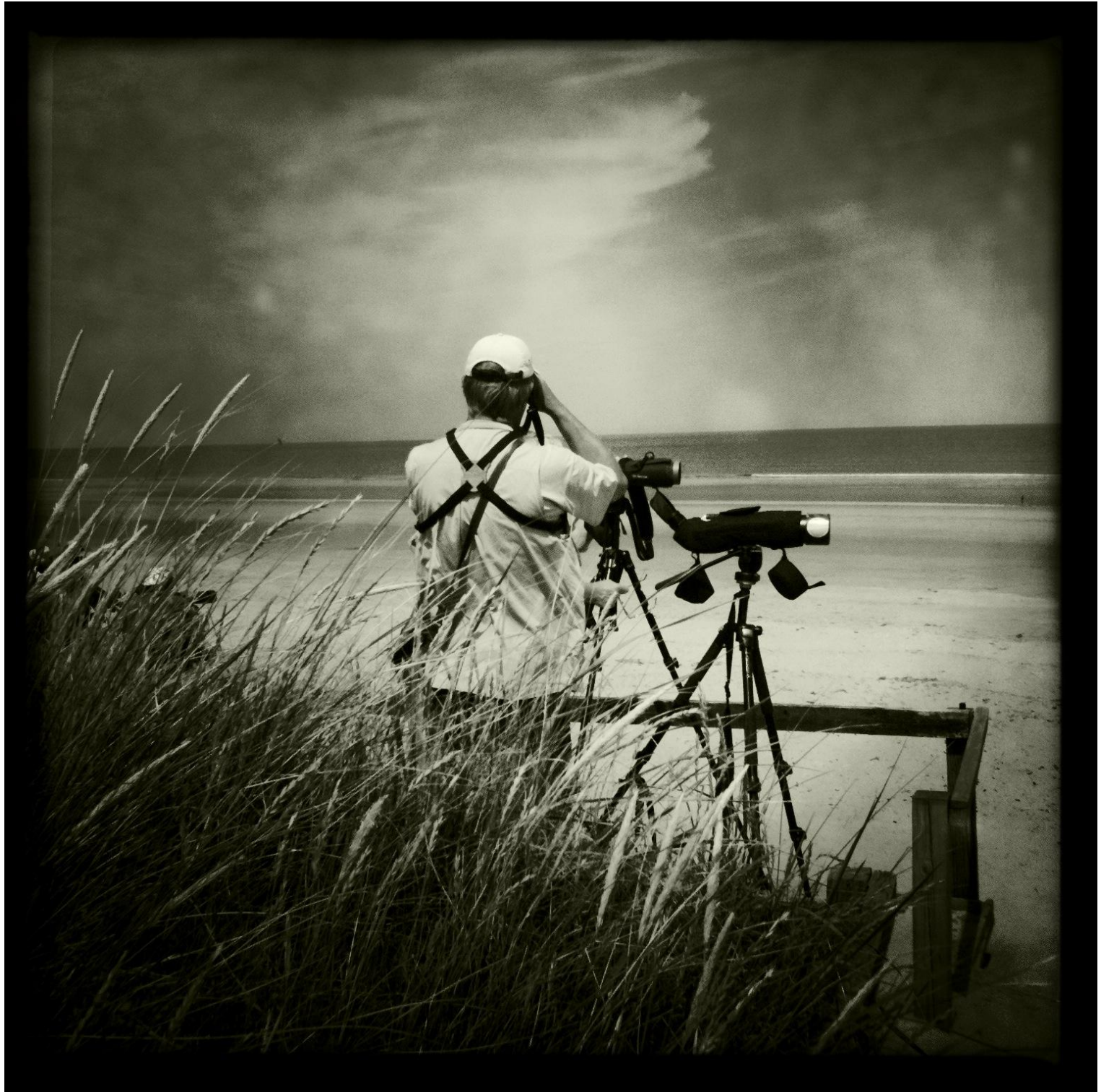
THE BIRDWATCHER – TITCHWELL