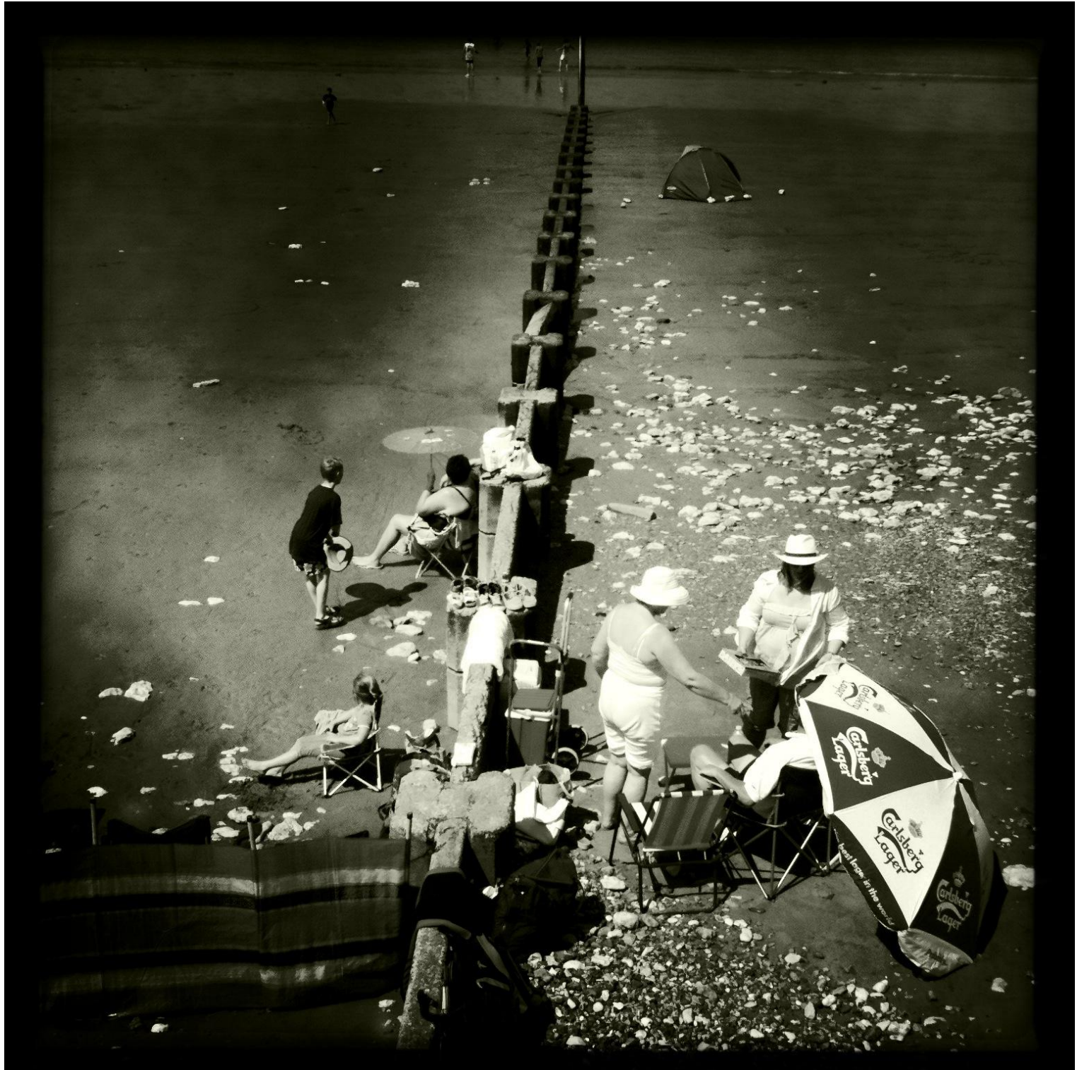
SUMMER HOLIDAY – HUNSTANTON