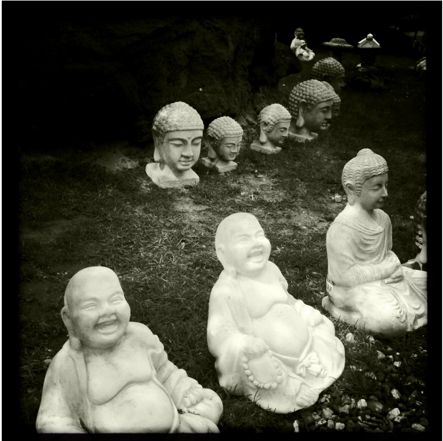
BUDDHA AND OTHER STATUES – HEACHAM