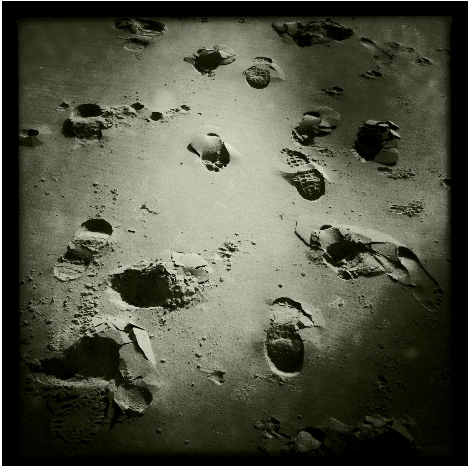
FOOTSTEPS IN THE SAND – BURNHAM OVERY BEACH