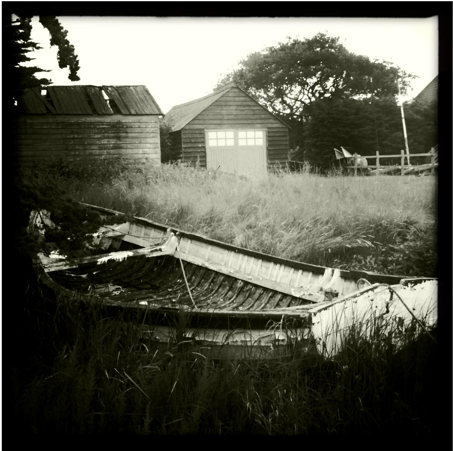
OLD ROWING BOAT – BRANCASTER STAITHE