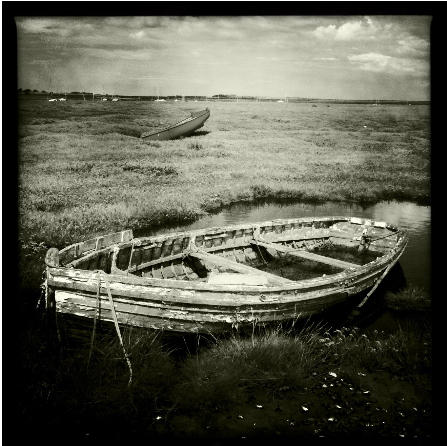
A BOAT'S FINAL RESTING PLACE – BRANCASTER STAITHE