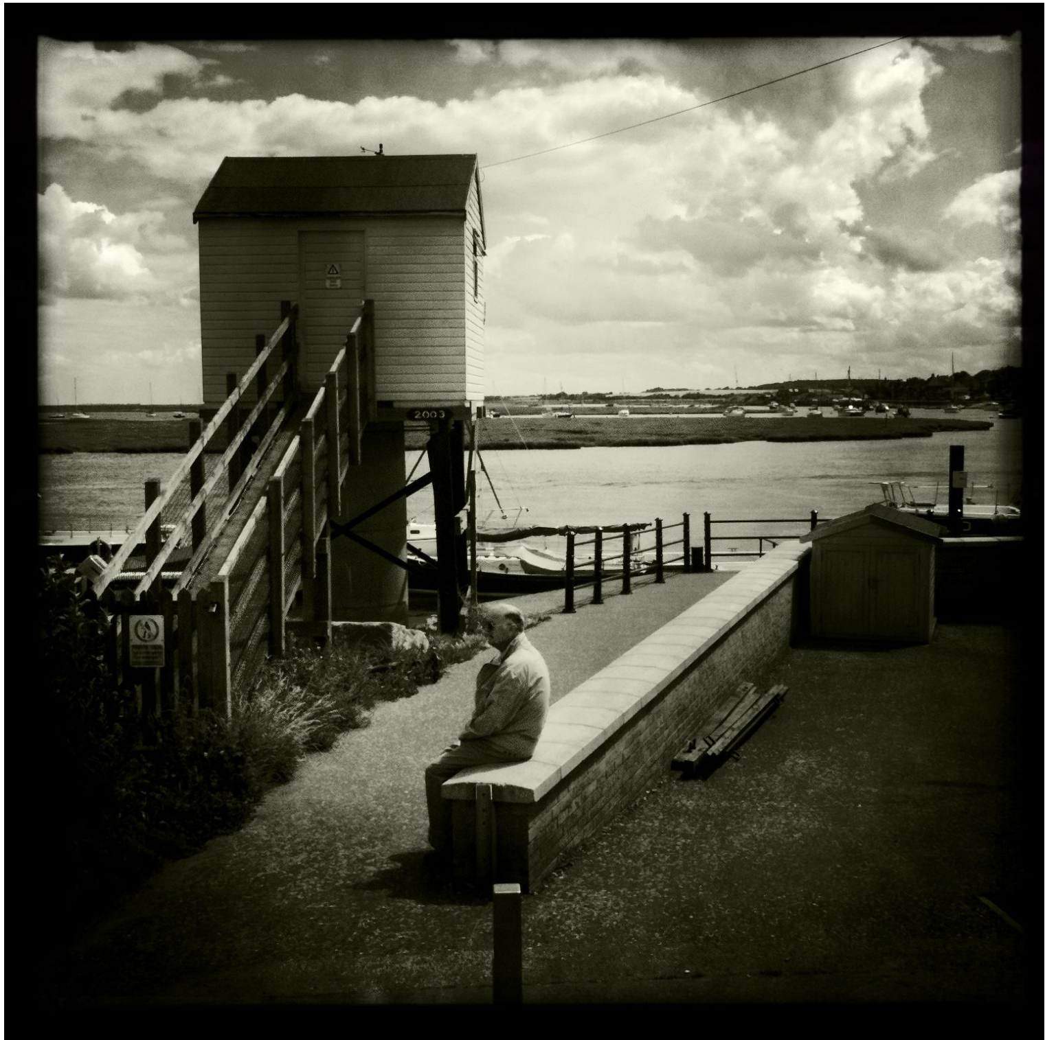
THE WAITING GAME – WELLS-NEXT-THE-SEA