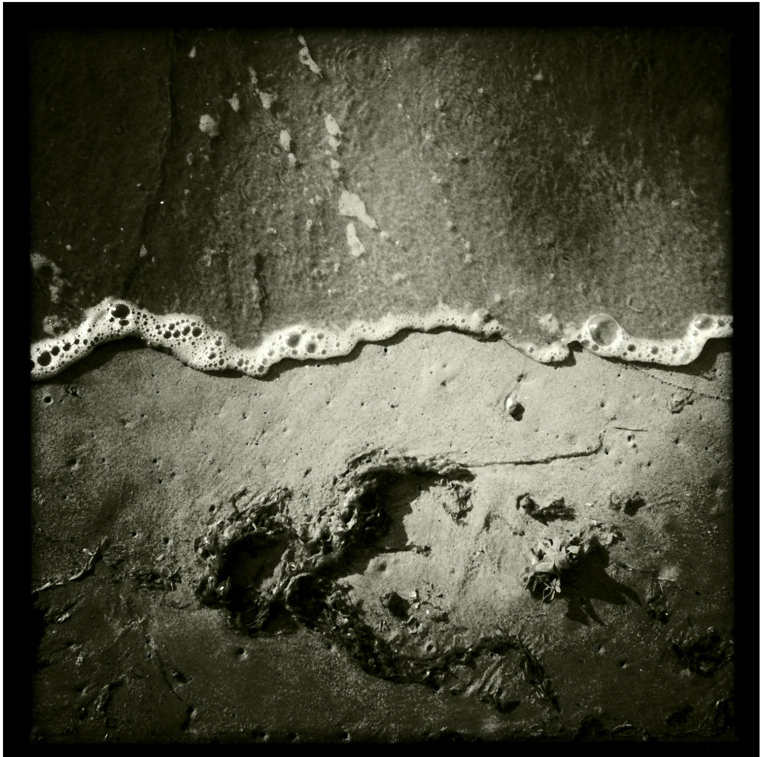
TIDE – BURNHAM OVERY BEACH