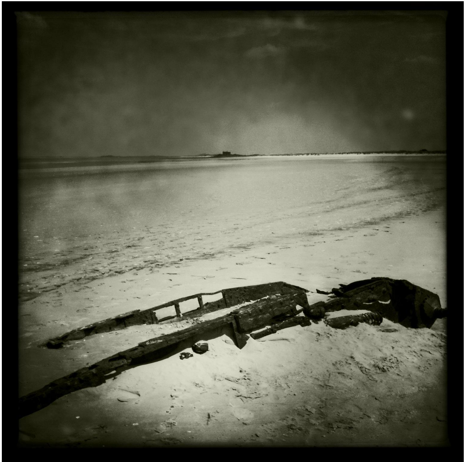
THE REMAINS OF A WORLD WAR II TANK – TITCHWELL