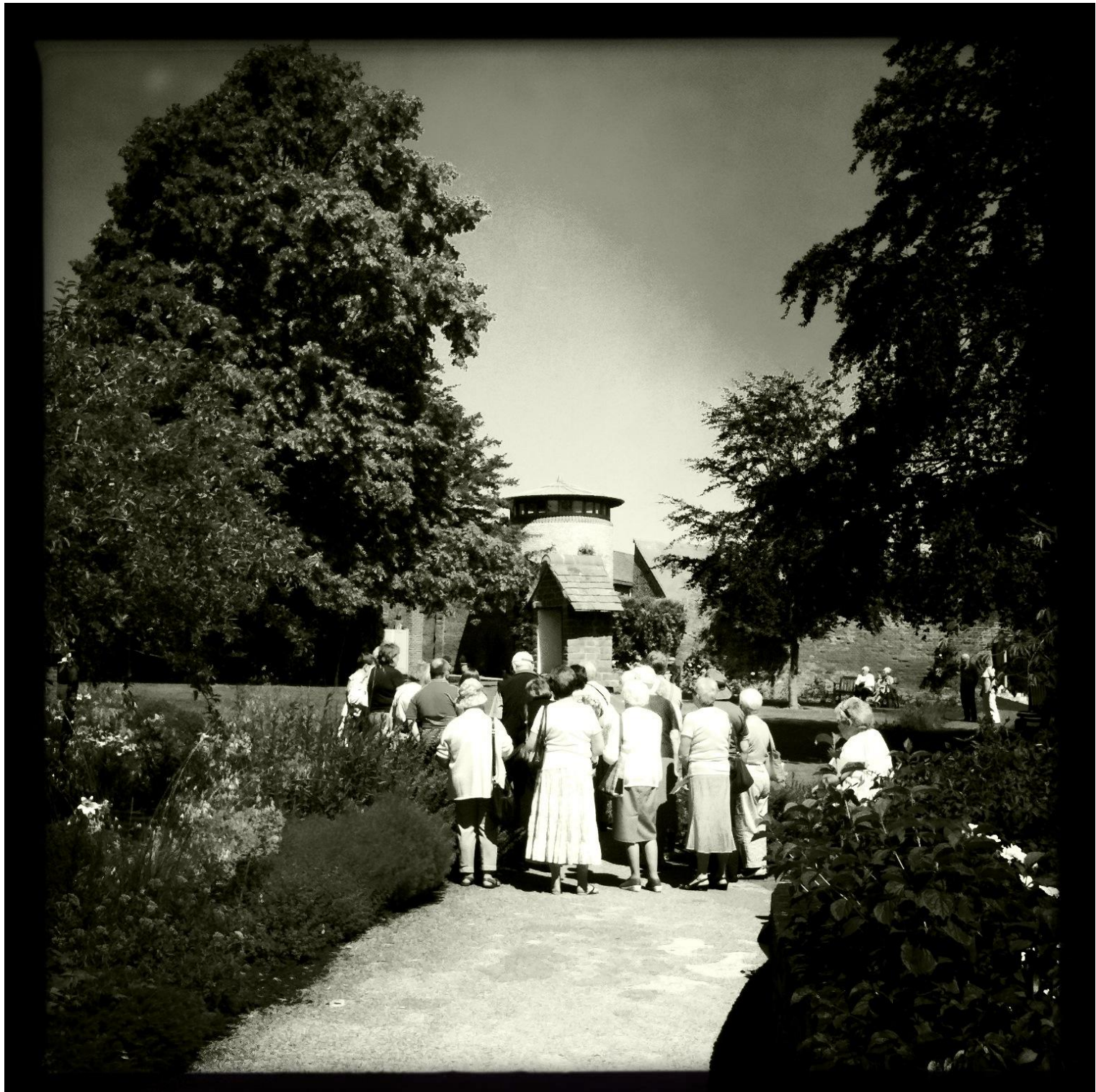
PILGRIMAGE SERVICE – WALSINGHAM