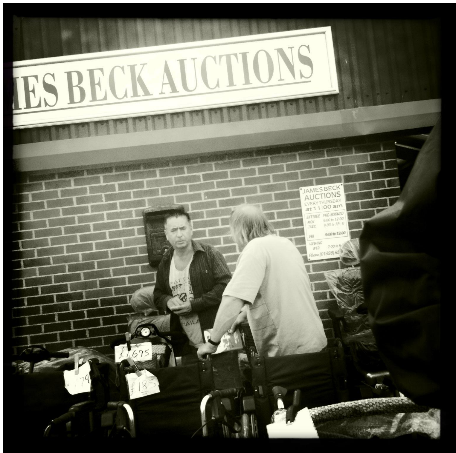
MAKING AN OFFER – FAKENHAM