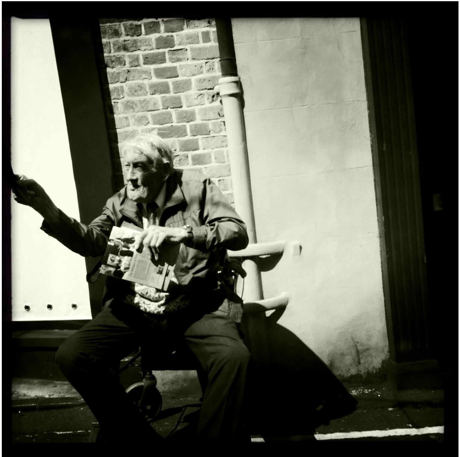
THE PAMPHLET MAN – WELLS-NEXT-THE-SEA