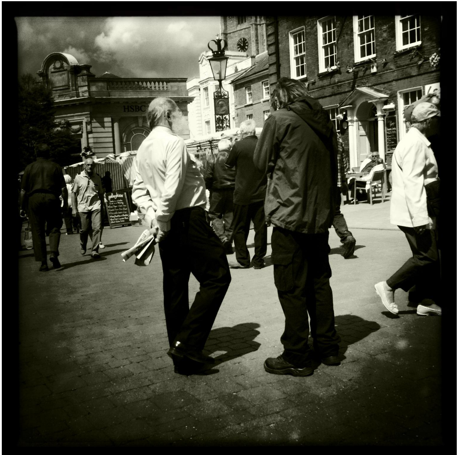
THE CONVERSATION – FAKENHAM