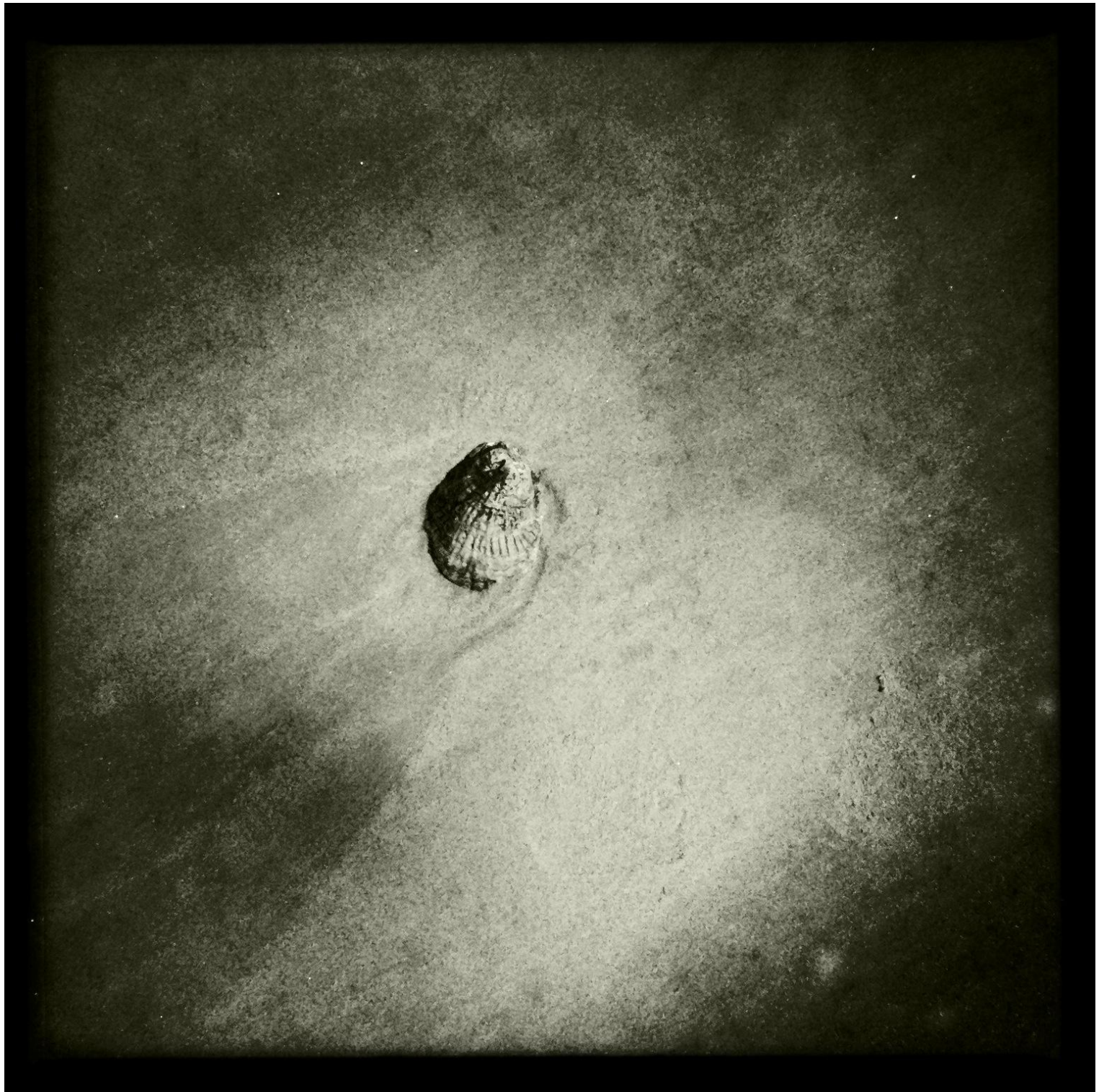
MARK OF THE TIDE – THORNHAM STAITHE