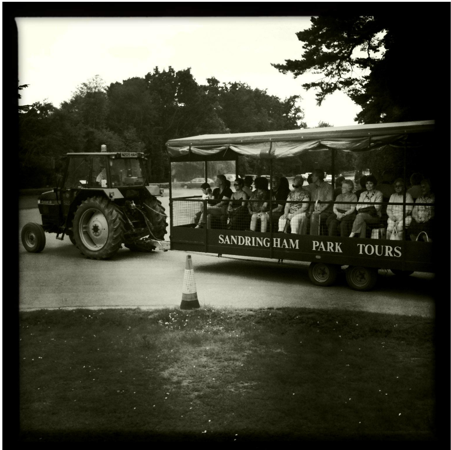
ON THE TOUR – SANDRINGHAM