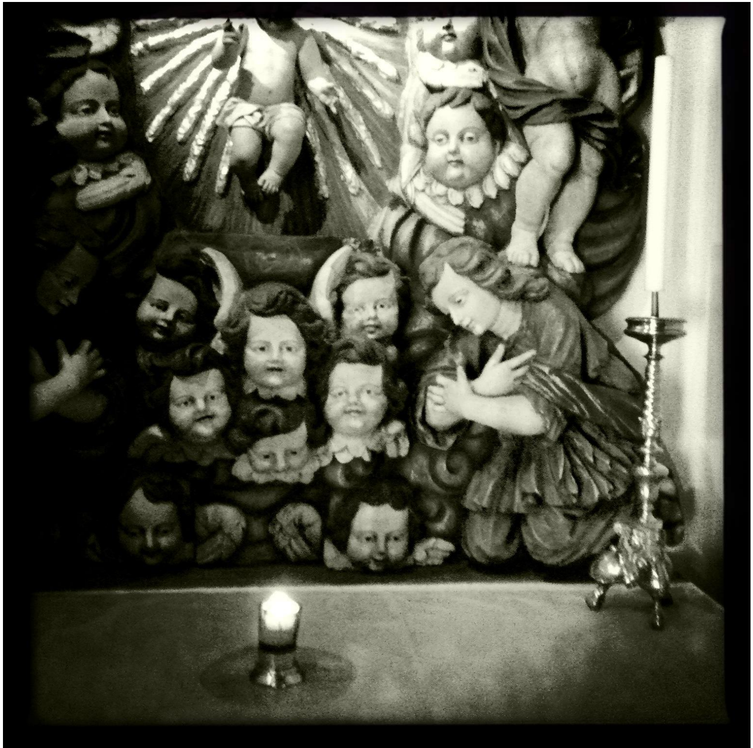
PILGRIMAGE SHRINE – WALSINGHAM