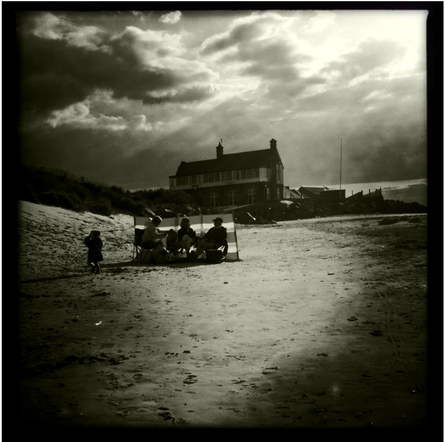
A LOVELY DAY AT THE BEACH – BRANCASTER