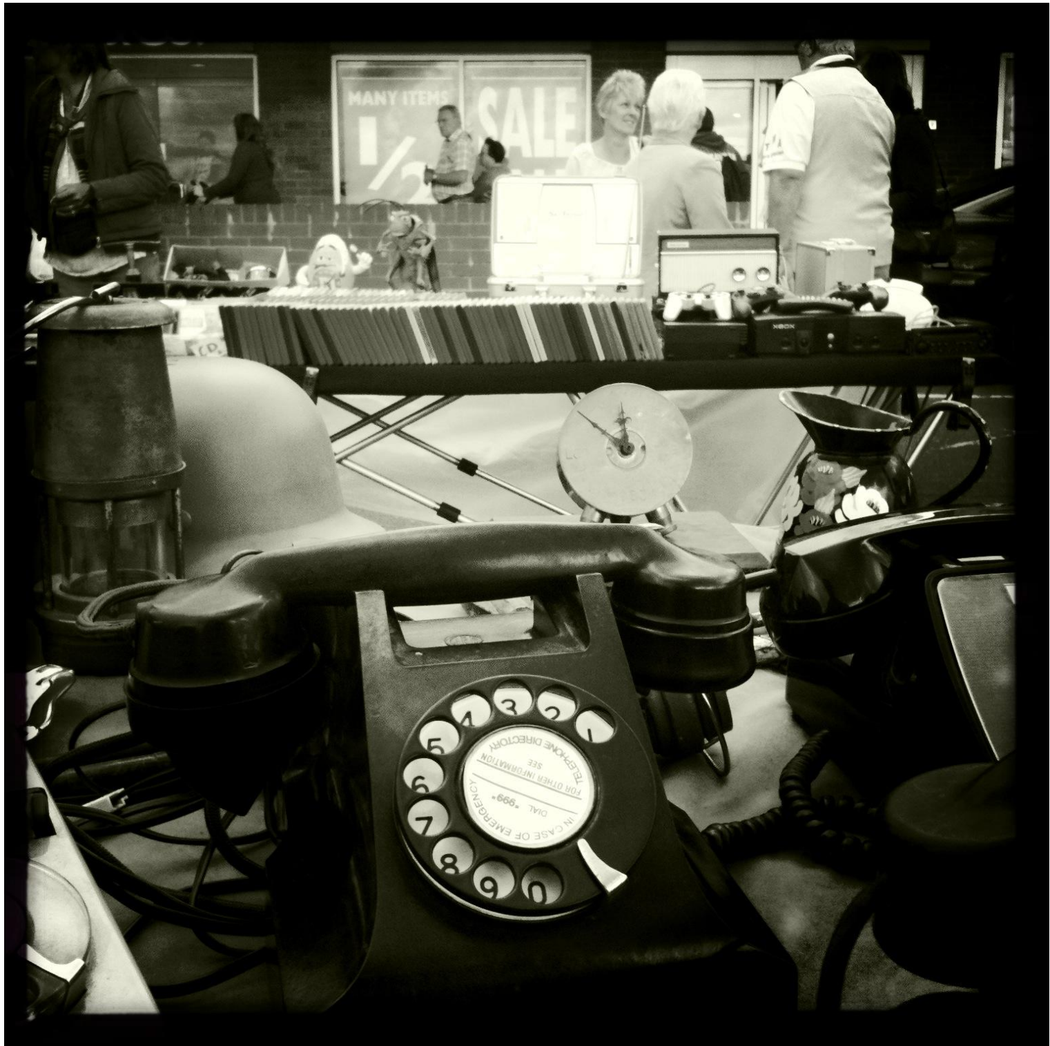
BRIC-A-BRAC – FAKENHAM