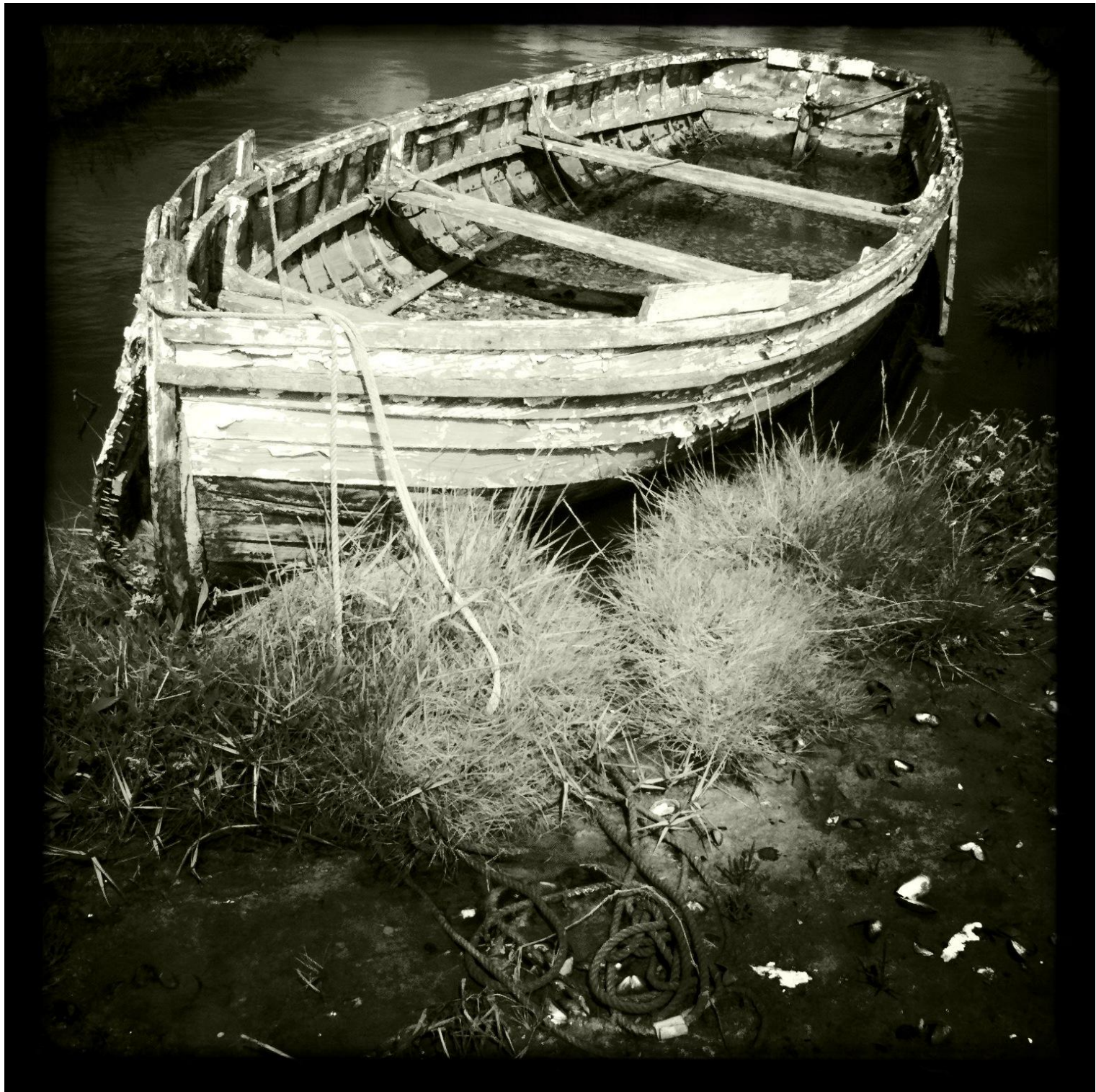
OLD ROWING BOAT – BRANCASTER STAITHE