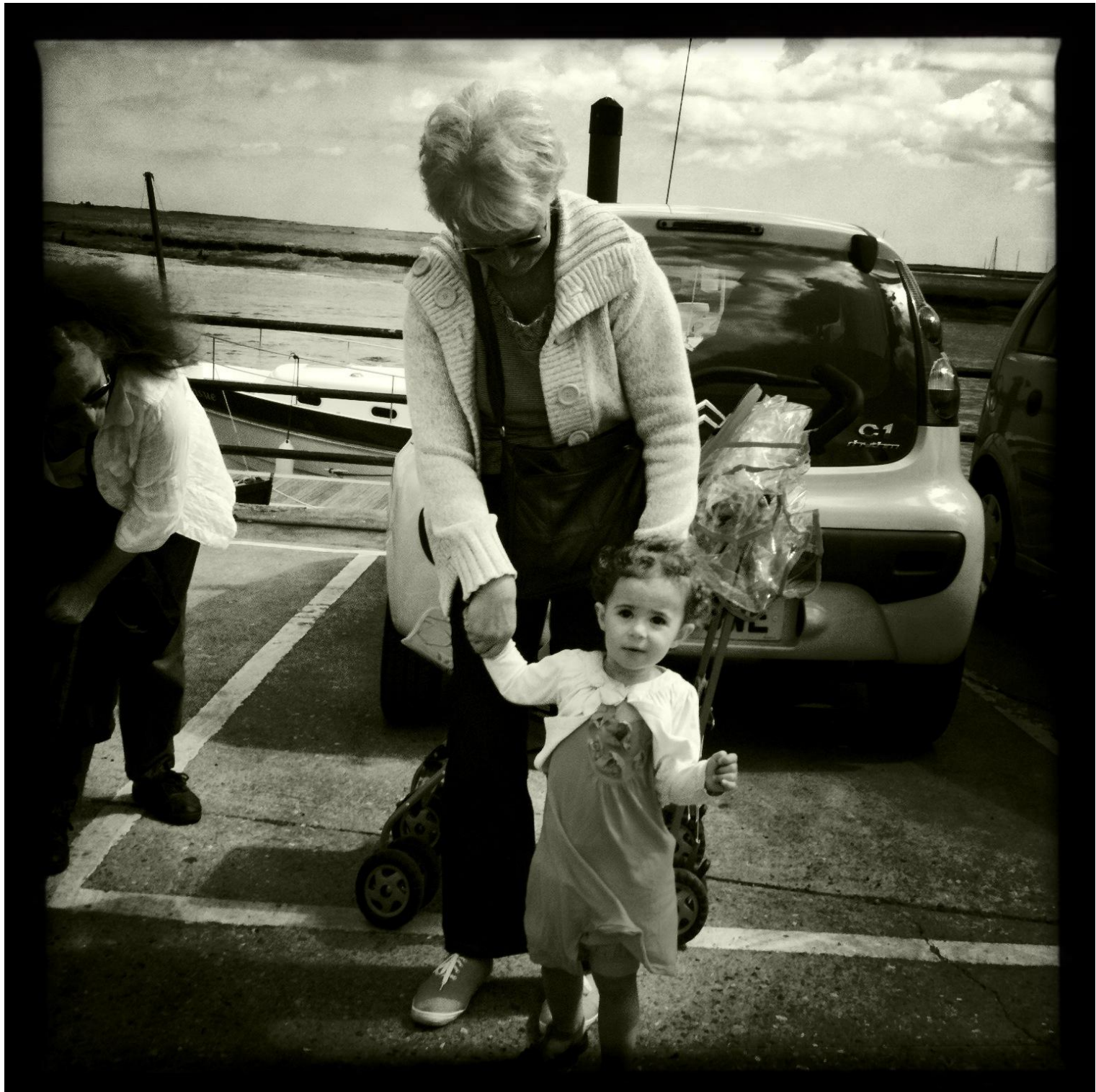
ENJOYING THE SEASIDE – WELLS-NEXT-THE-SEA