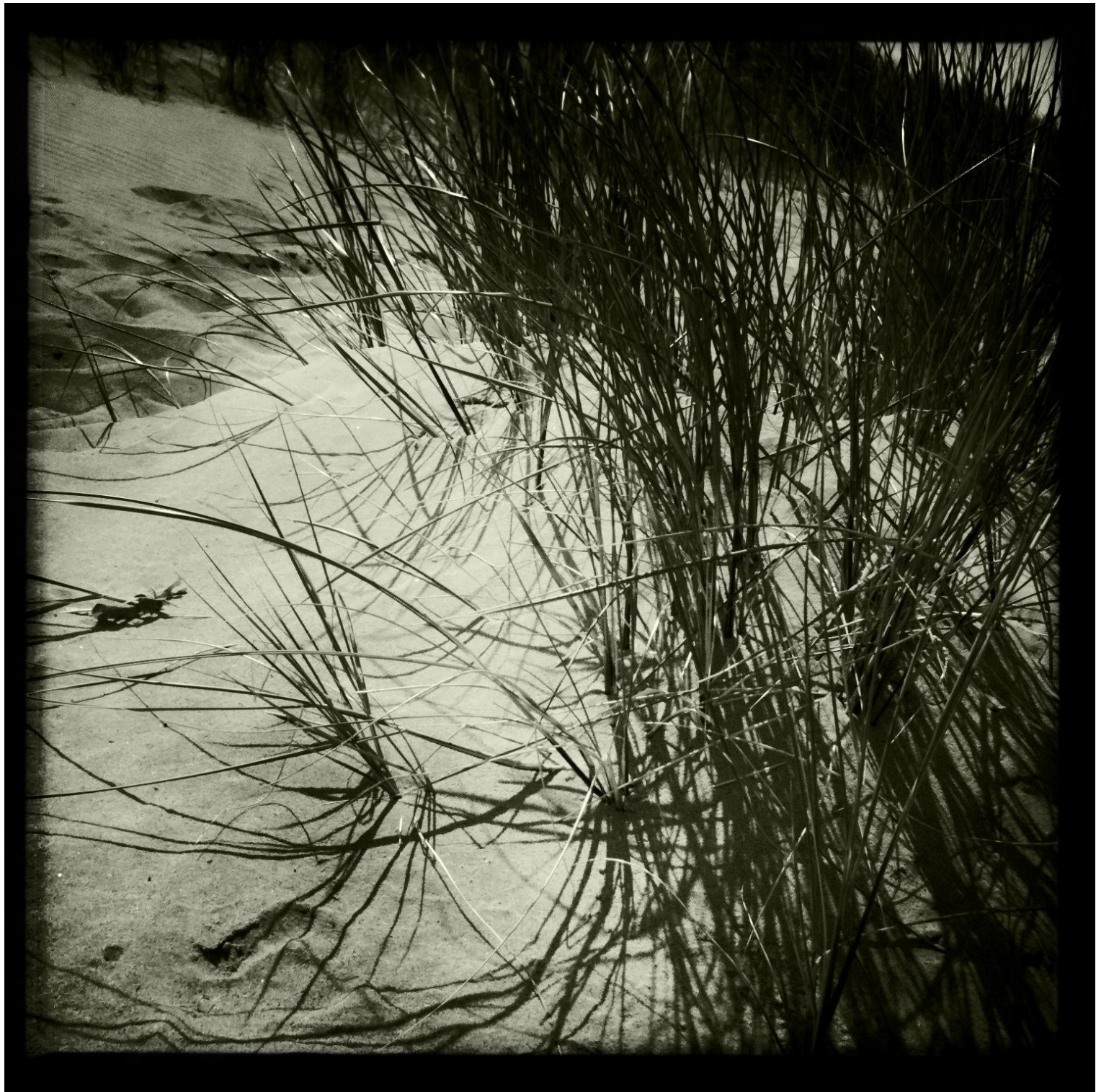
DUNE GRASS – THORNHAM STAITHE