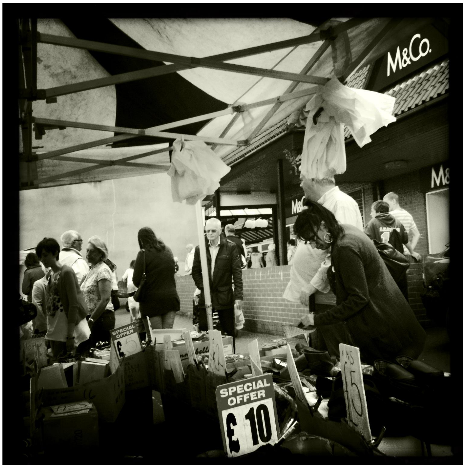
LOOKING FOR A BARGAIN – FAKENHAM