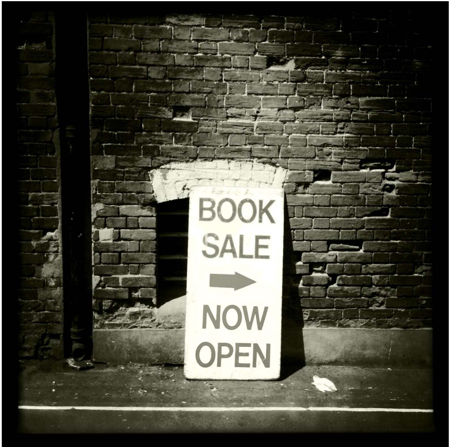
BOOK SALE – WELLS-NEXT-THE-SEA