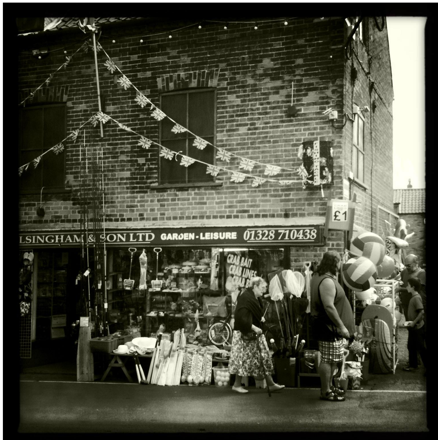
MOTHER AND SON – WELLS-NEXT-THE-SEA