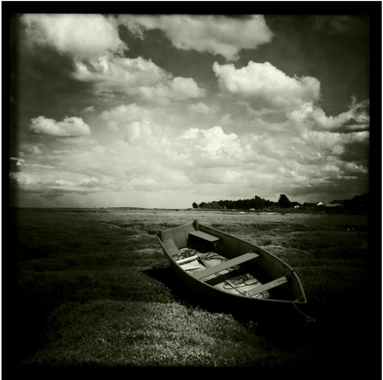
ROWING BOAT – BRANCASTER STAITHE