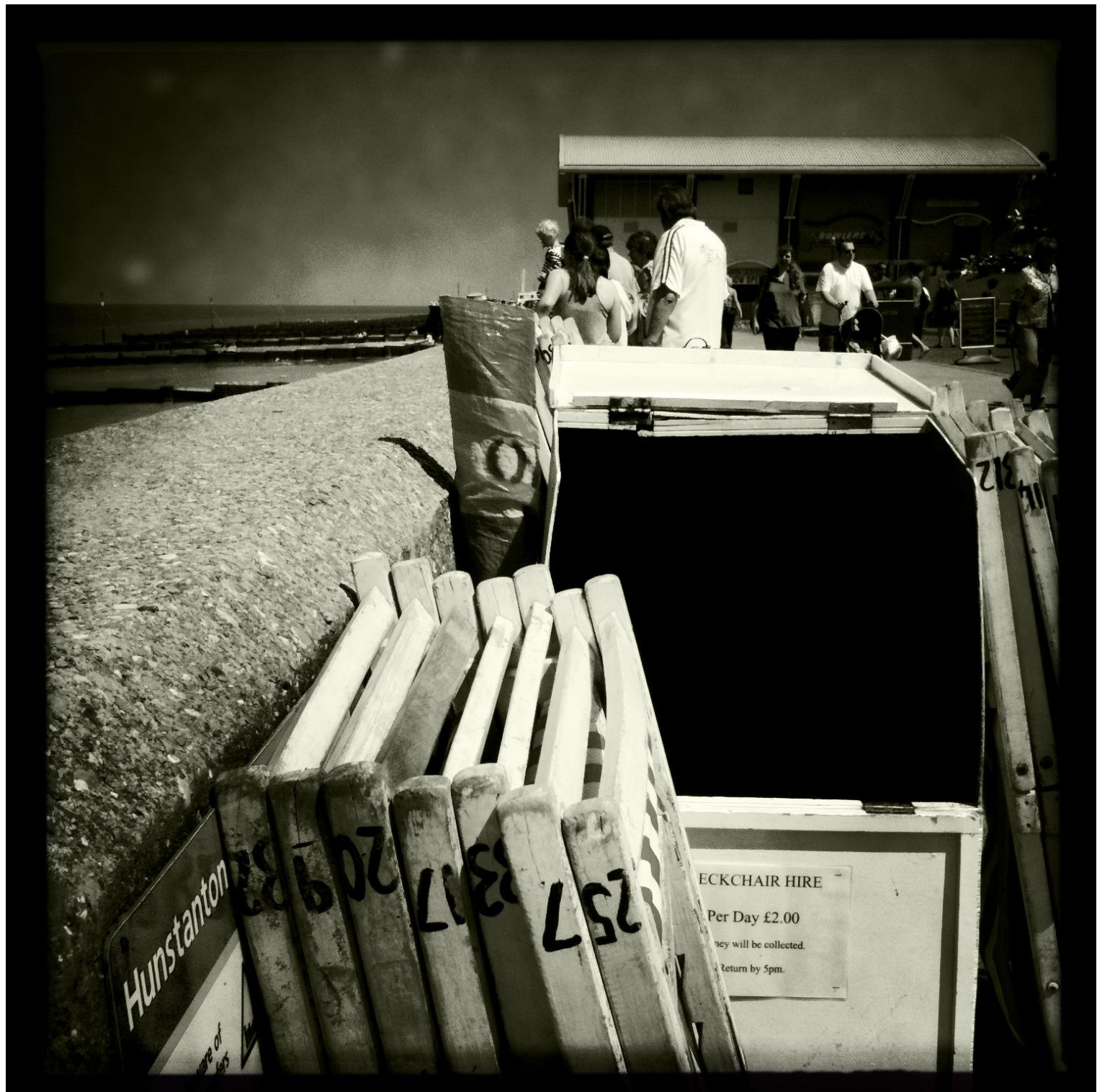
DECKCHAIR HIRE – HUNSTANTON