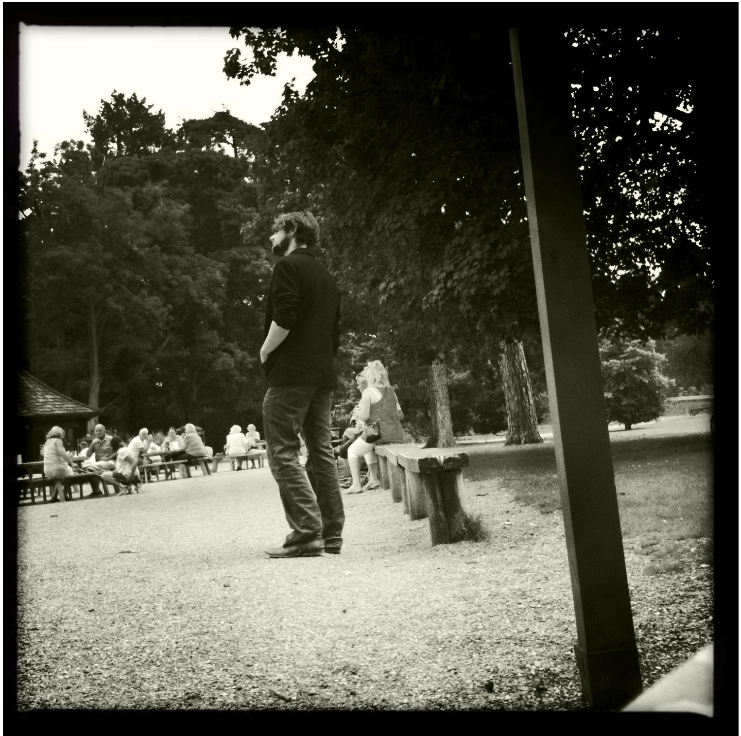
THE VISITOR – SANDRINGHAM