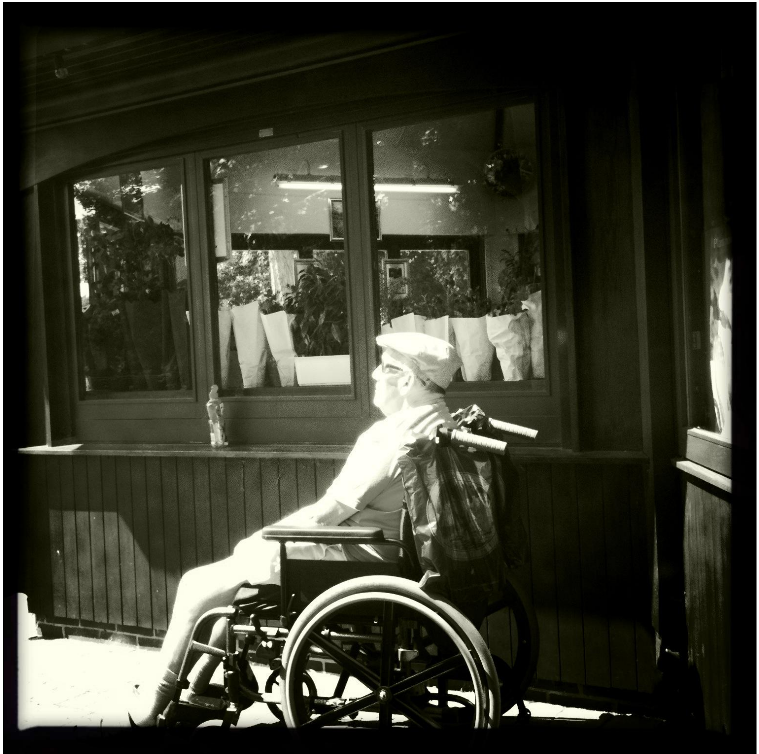
ENJOYING THE SUN – SANDRINGHAM