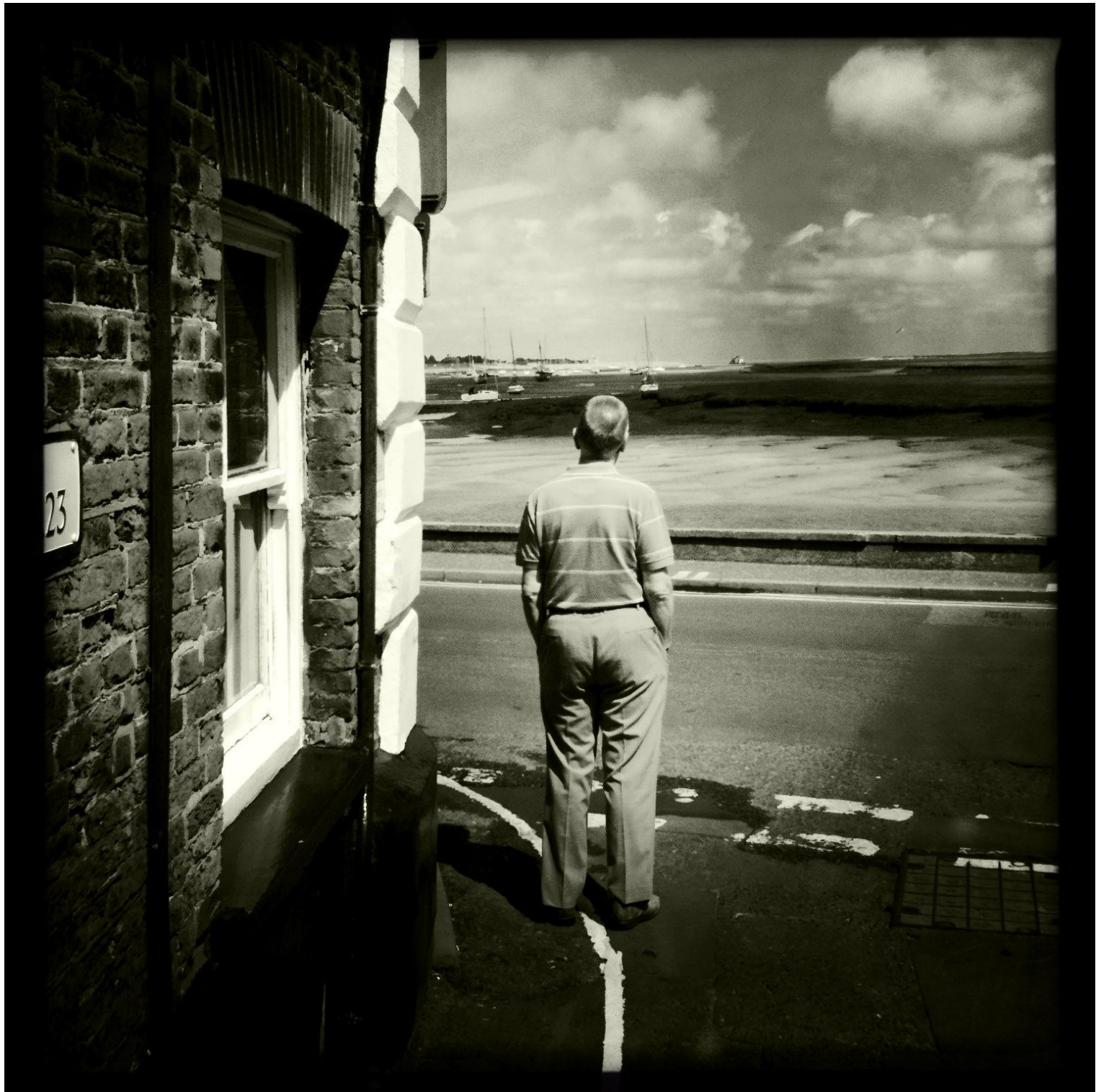
TAKING IN THE VIEW – WELLS-NEXT-THE-SEA