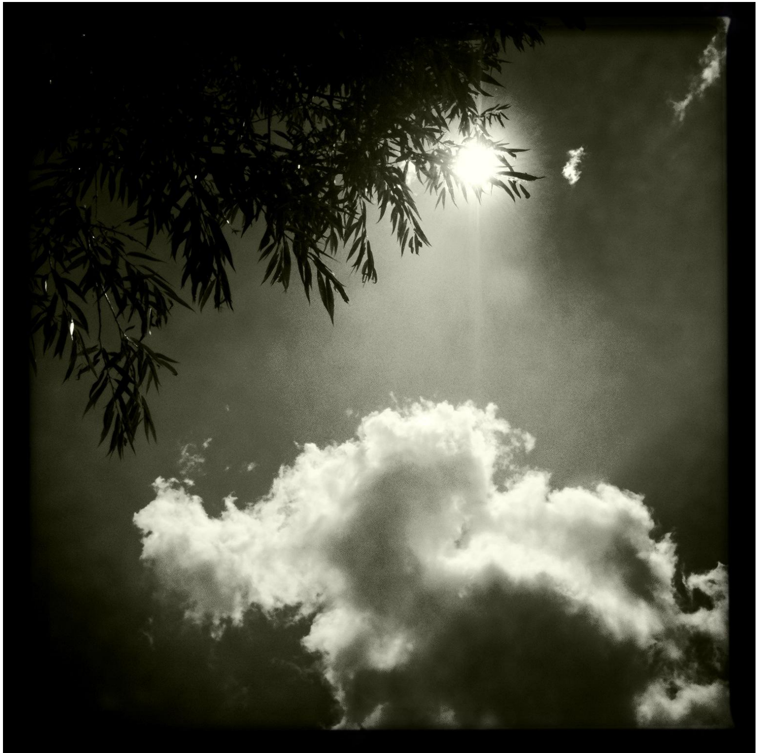
SUMMER SUN – BURNHAM THORPE