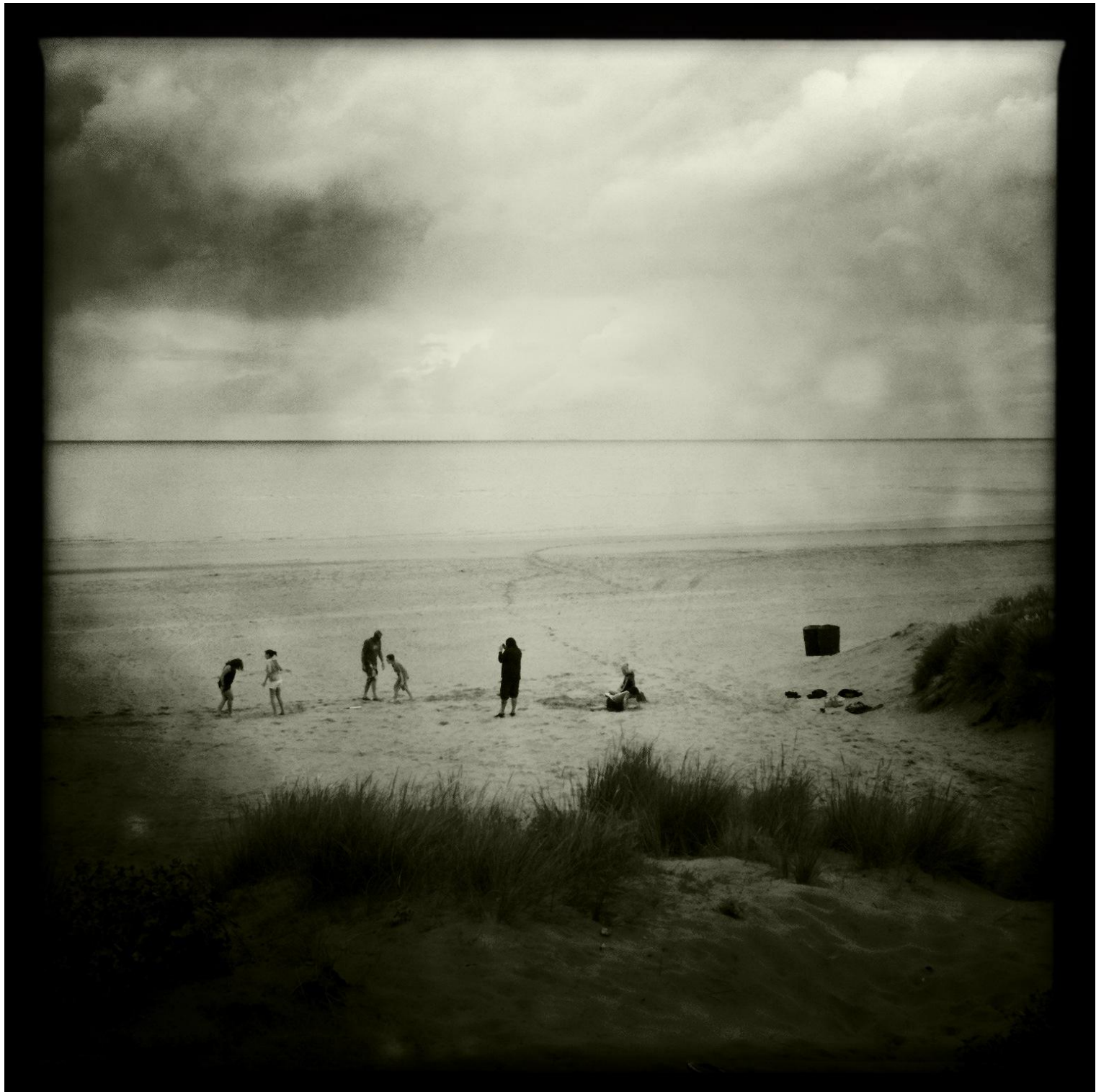
FAMILY PHOTO – OLD HUNSTANTON