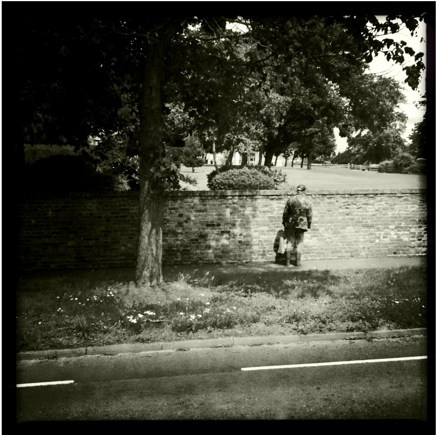
LOOKING OVER THE WALL – FAKENHAM