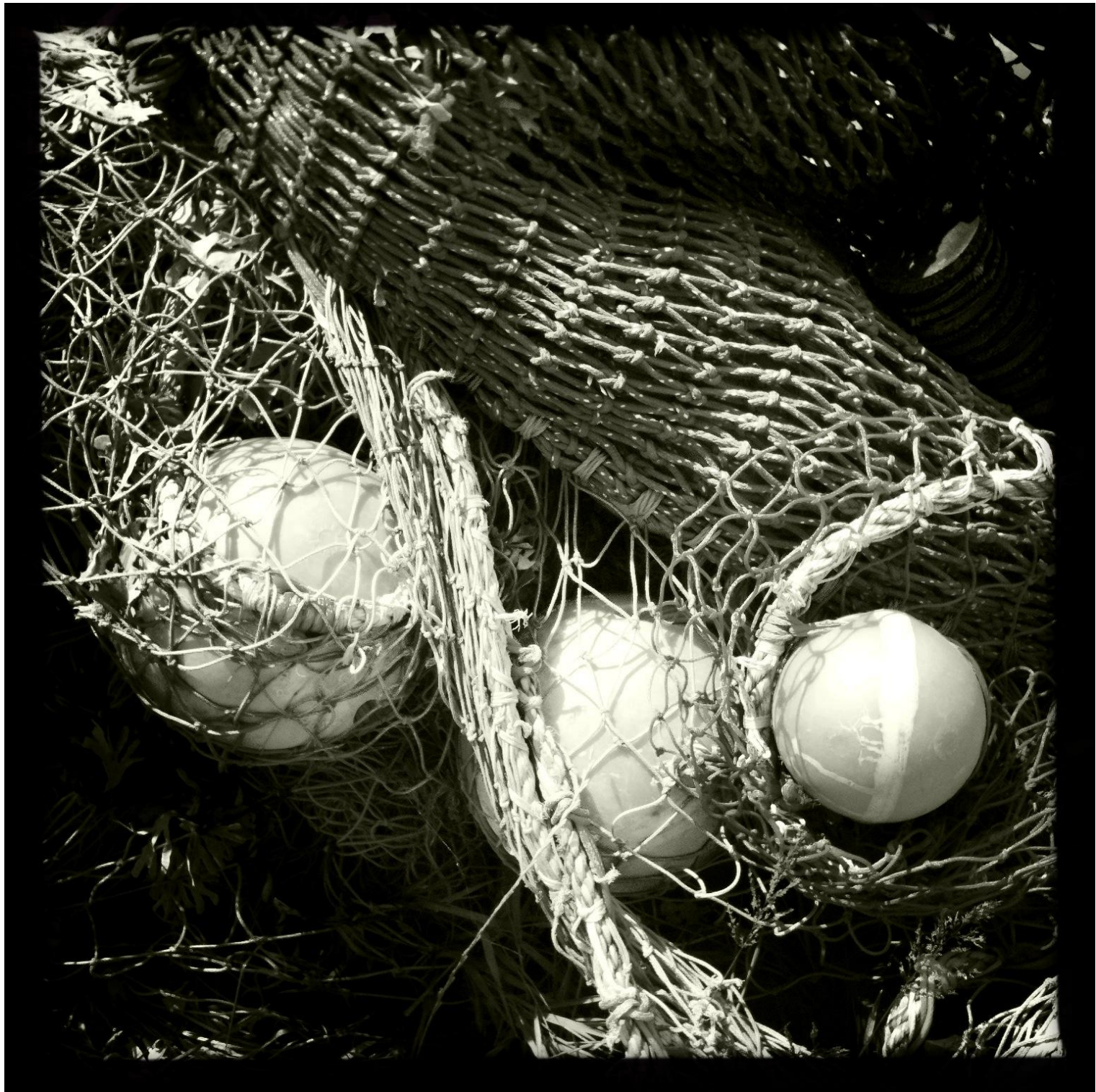
FISHING NETS – BRANCASTER STAITHE