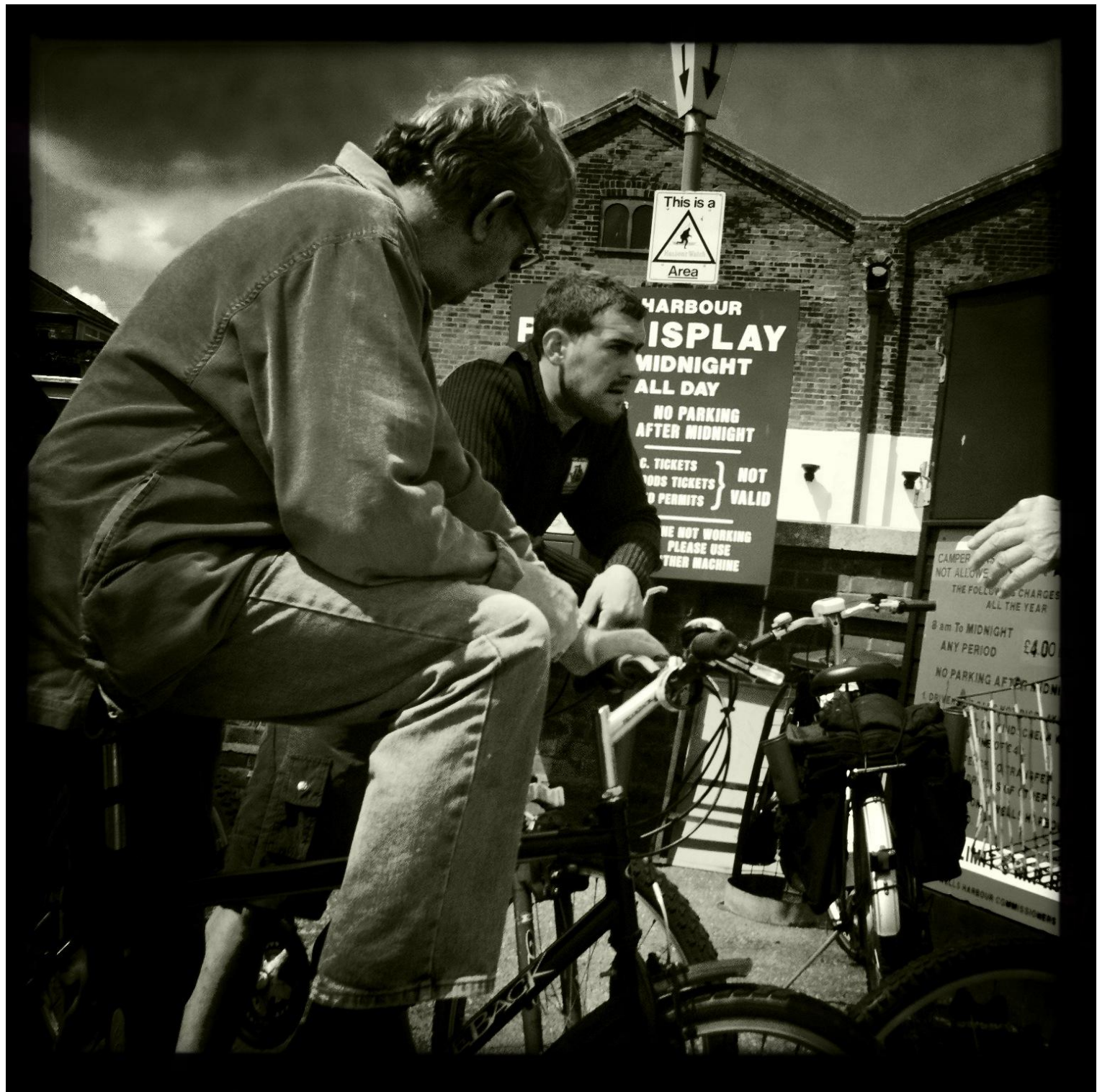
THE CONVERSATION – WELLS-NEXT-THE-SEA