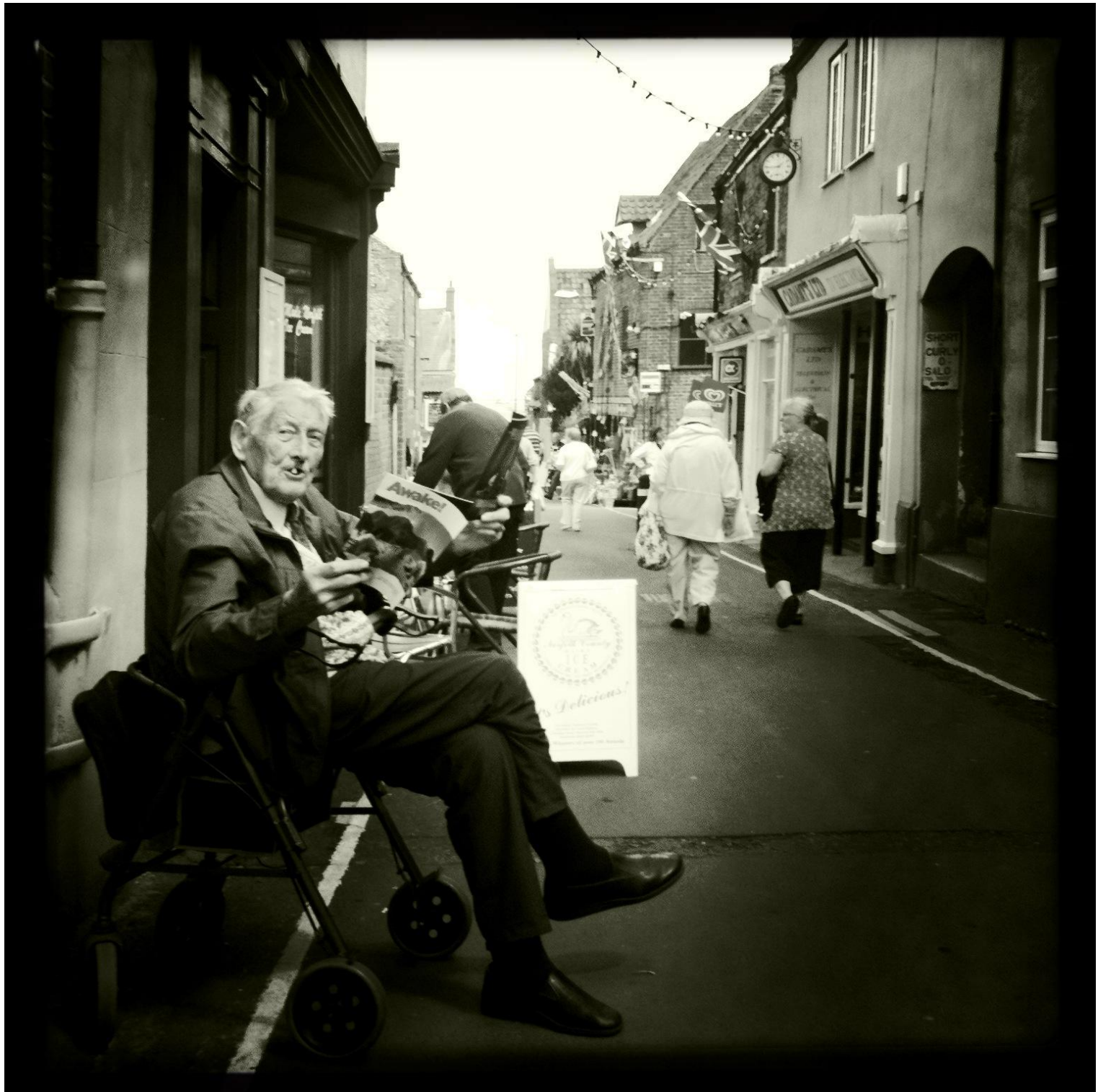
THE PAMPHLET MAN – WELLS-NEXT-THE-SEA