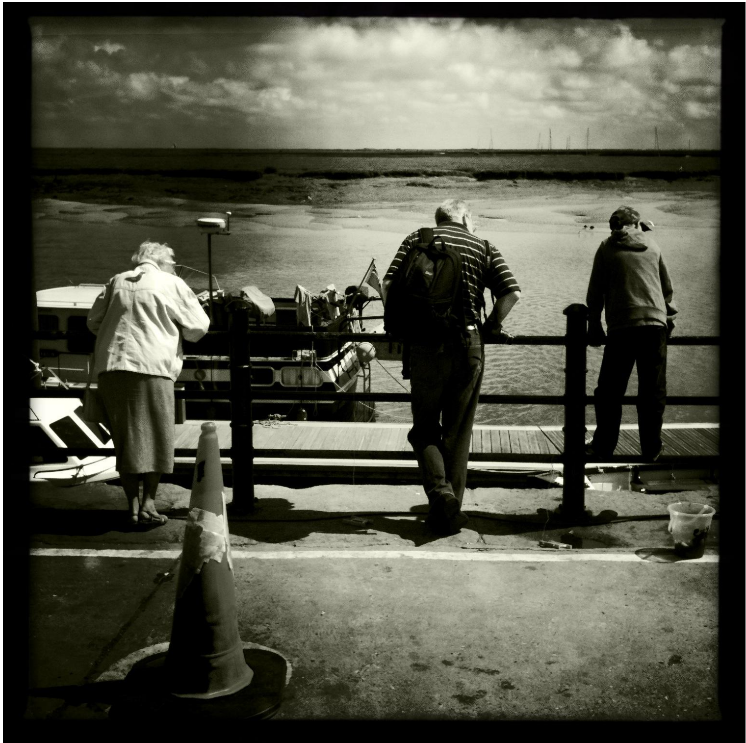
FISHING FOR CRABS – WELLS-NEXT-THE-SEA