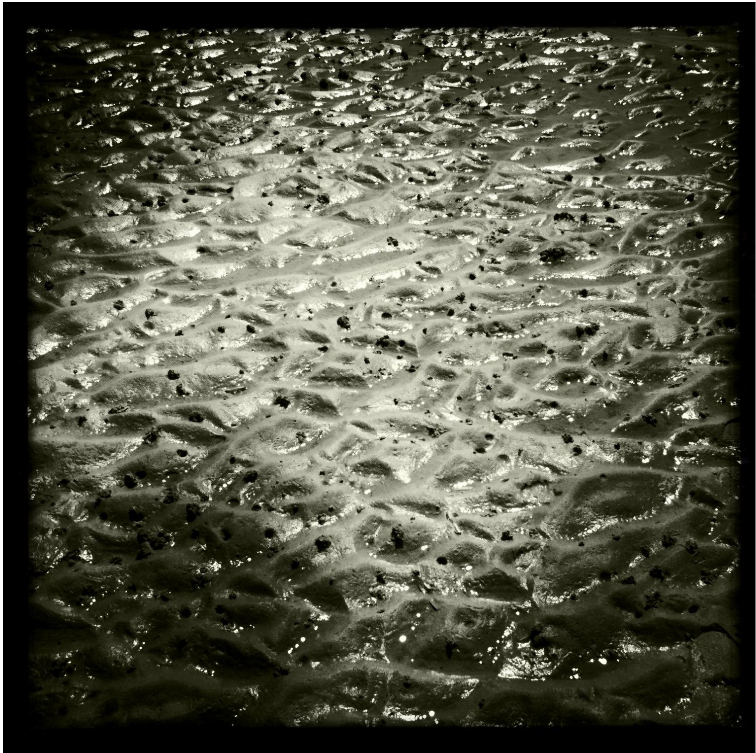
WET SAND – THORNHAM STAITHE