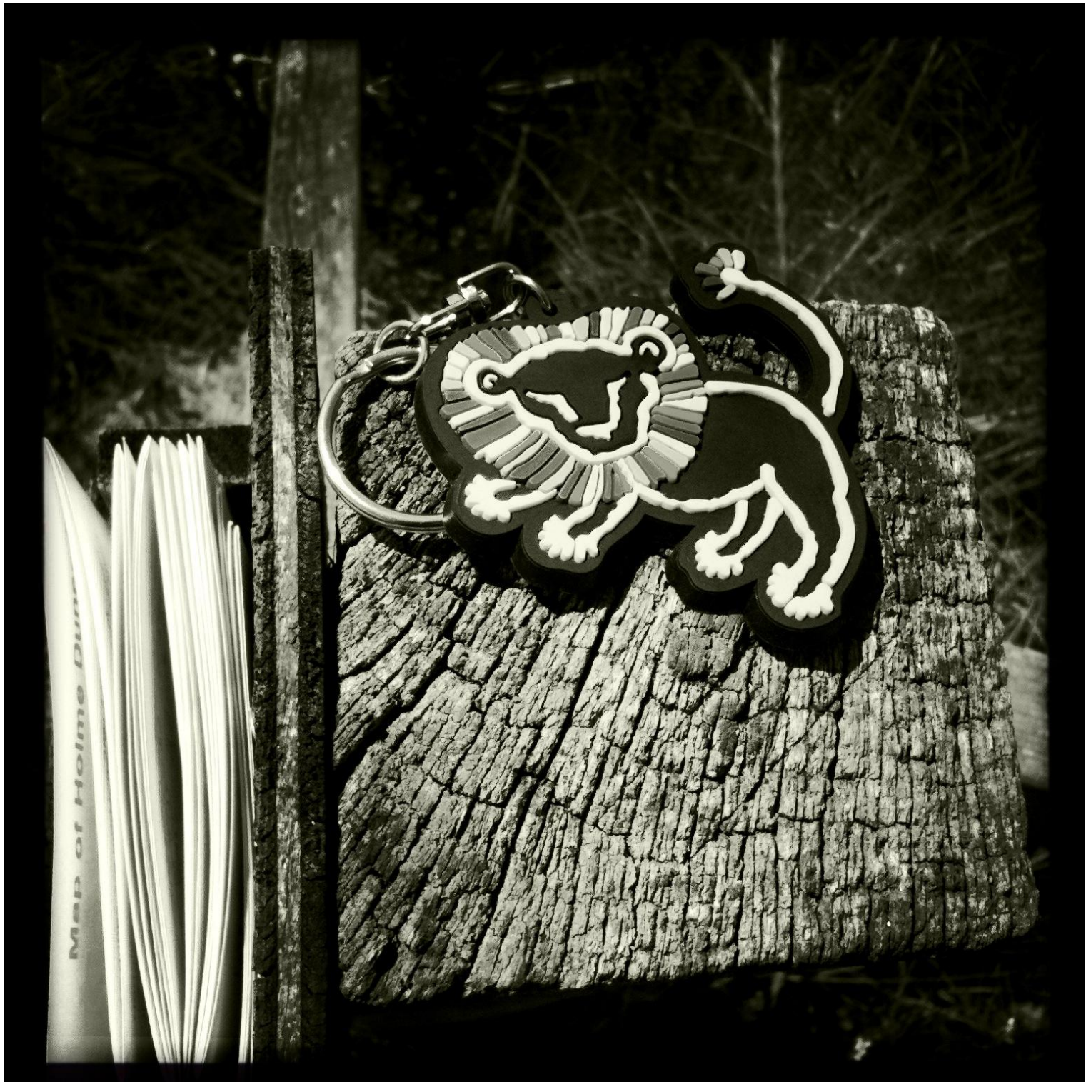
LOST KEYRING – THORNHAM STAITHE