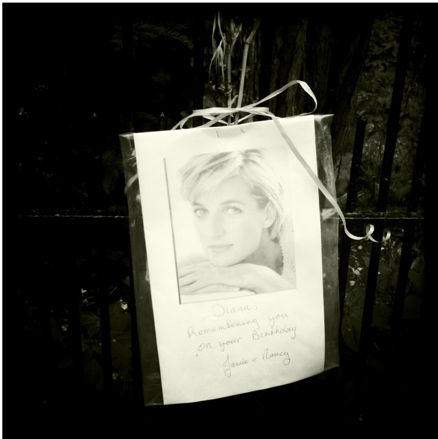
PRINCESS DIANA BIRTHDAY MEMORIAL – SANDRINGHAM