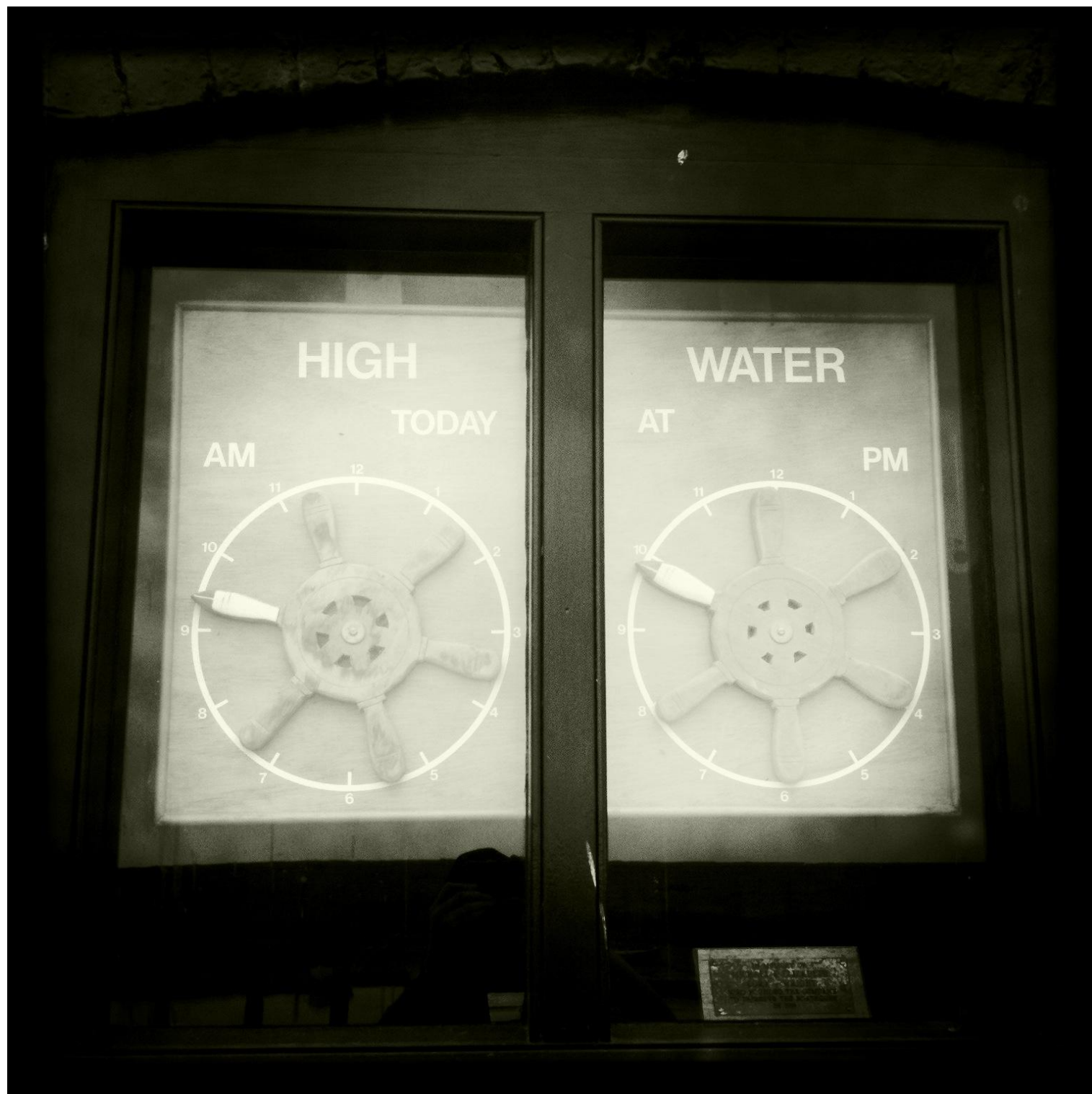
HIGH WATER TIMES – BURNHAM OVERY STAITHE