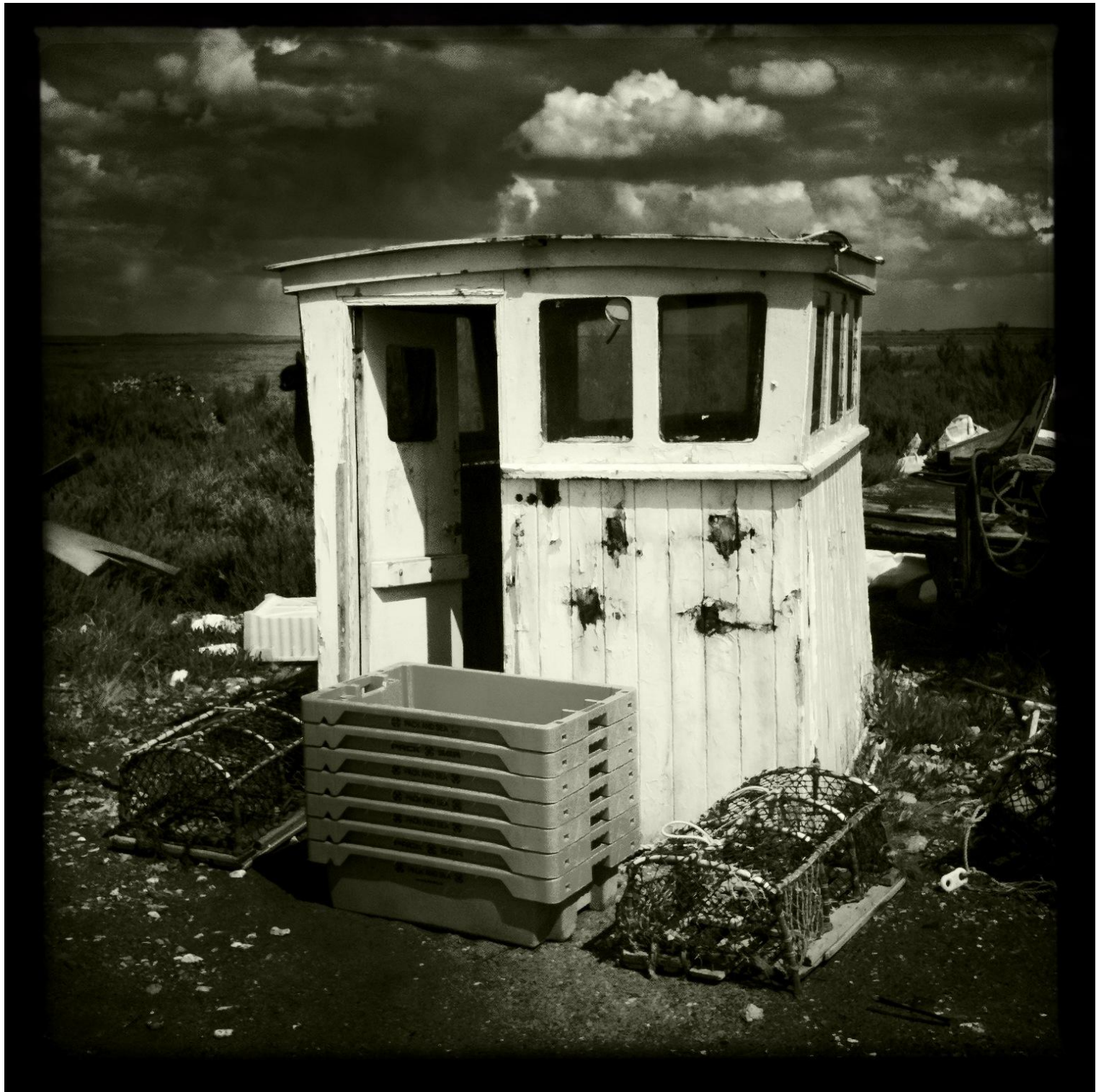
THE OLD WHEELHOUSE – BRANCASTER STAITHE