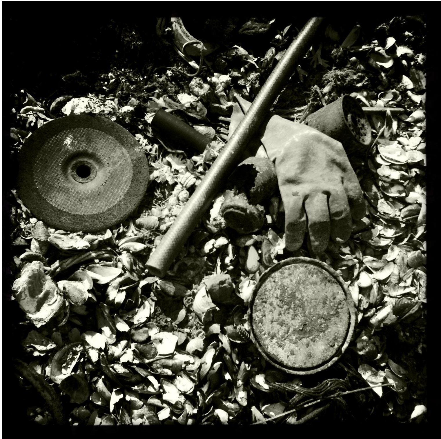
FISHERMAN'S RUBBISH HEAP – BRANCASTER STAITHE