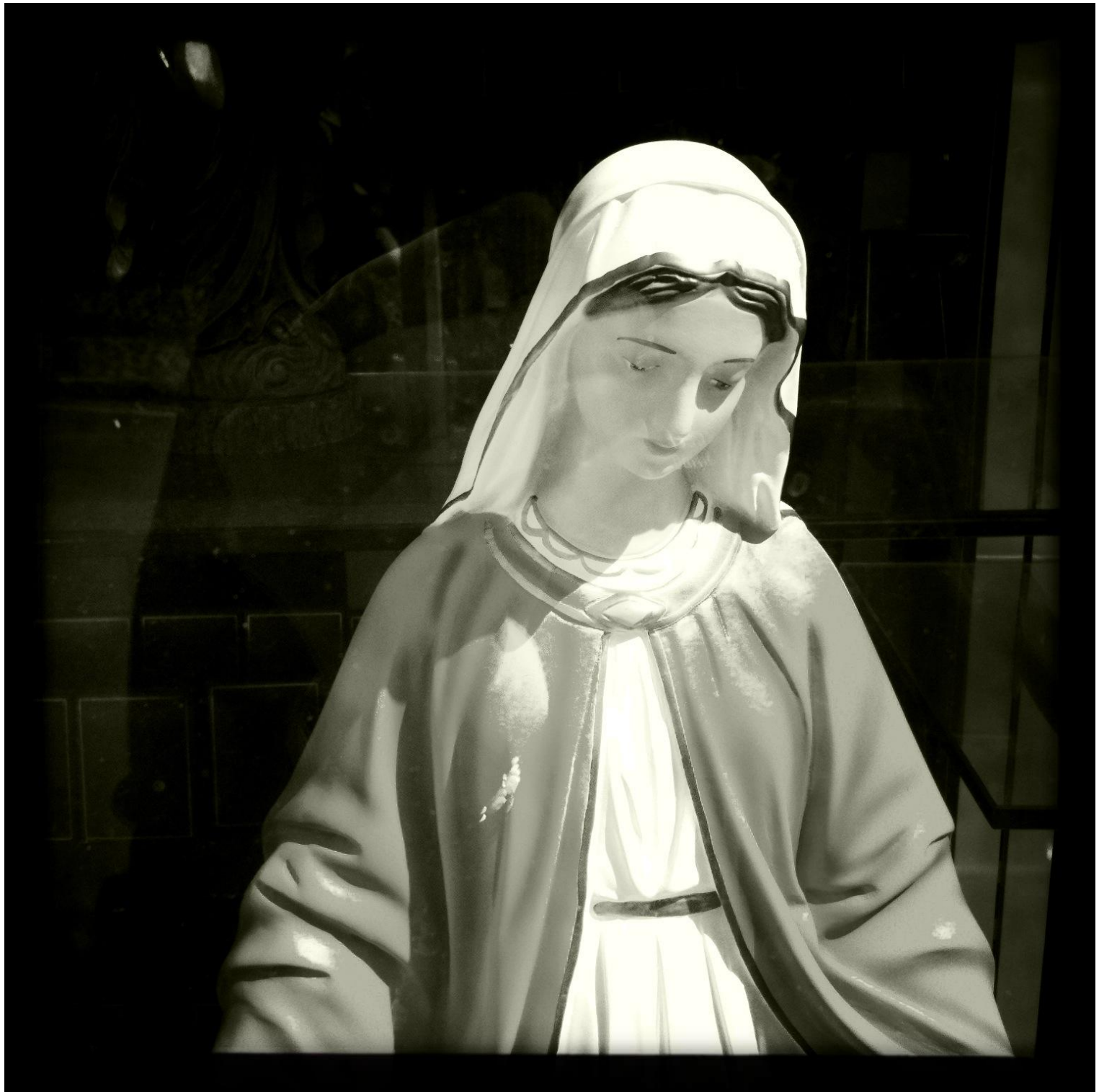
RELIGIOUS STATUE IN THE PILGRIM SHOP – WALSINGHAM